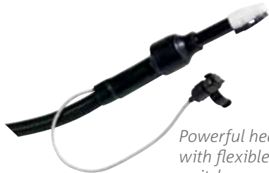
Powerful heating tool with flexible on/off switch