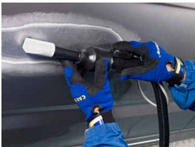
Heat shrinking of steel and aluminum panels during repair