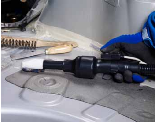
Heats through rubber and plastic