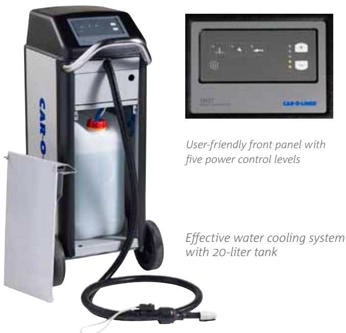
User-friendly front panel with five power control levels