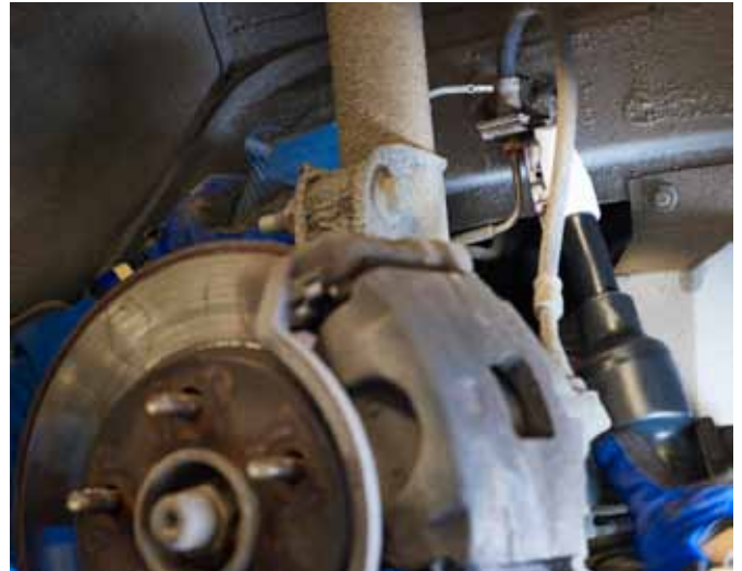
Does not overheat nearby sensitive parts