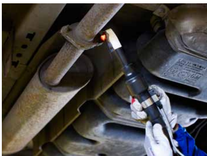
Heat rusted nuts and bolts on suspension, steering and exhaust