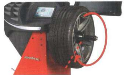
Stop in position

Two operators can operate with the balancer simultaneously and quickly recall their rim dimensions.