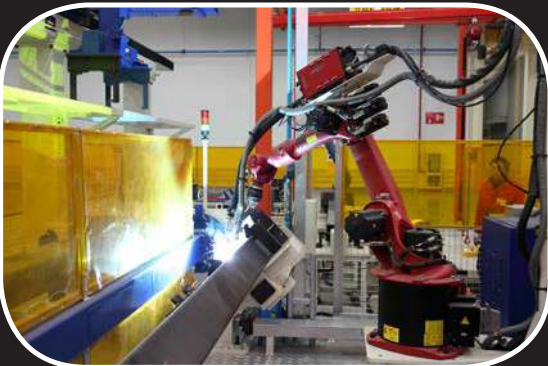
Robotic welding - High productivity, less downtime and consistent quality