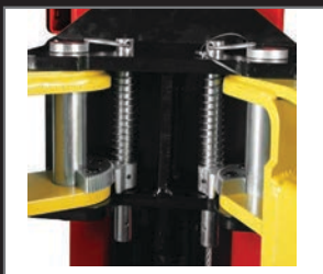
Heavy duty arm restraints