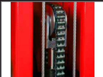
Electro-hydraulic chain over system