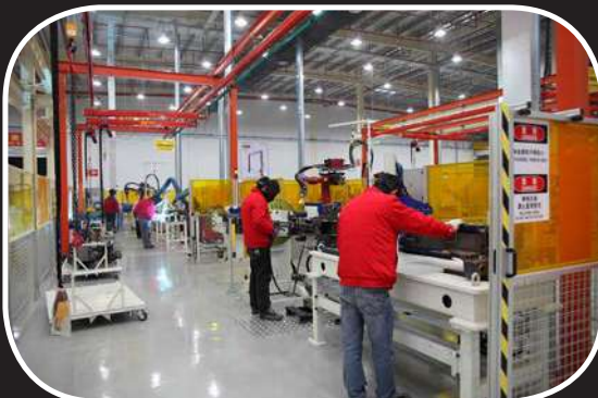
Organized, clean and systematic work environment to ensure safety and high quality control