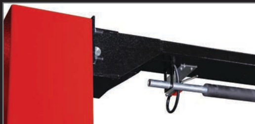
Safety shut-off bar