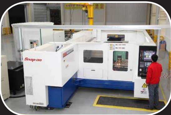
CNC lazer cutting provide precise cutting and efficient process