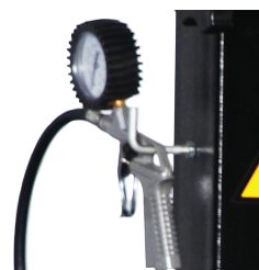
Pressure gauge for inflator