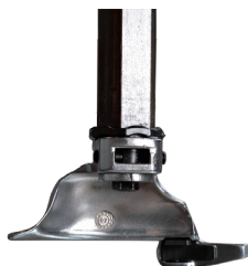
Mount / Demount Tool with plastic protection