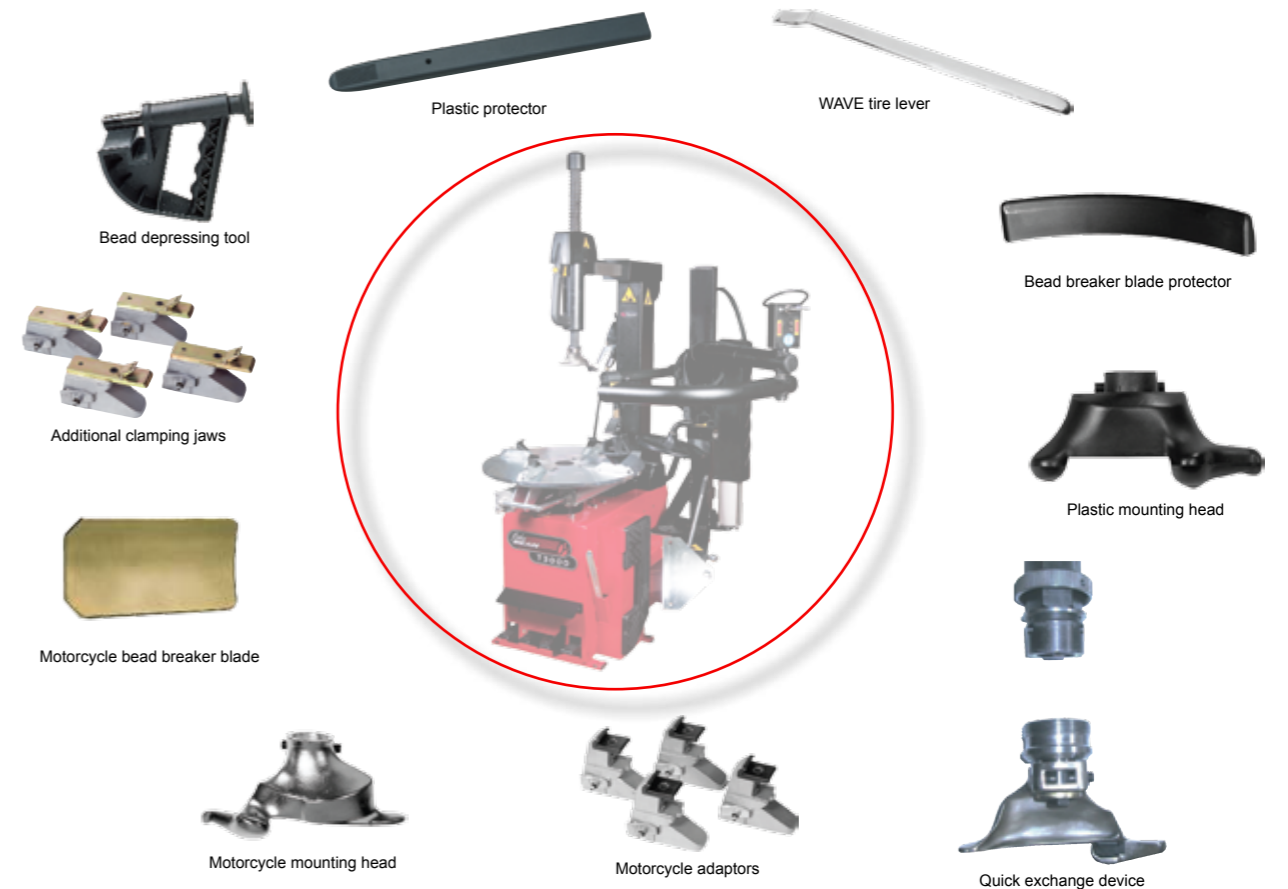
Bead depressing tool